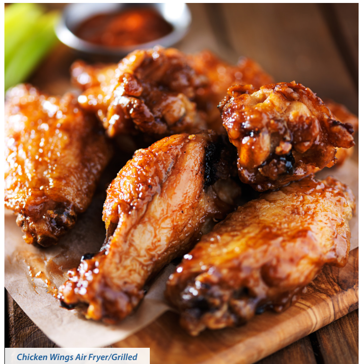
Chicken Wings Air Fryer/Grilled

In a large bowl, prepare fish sauce, soy sauce, garlic powder and black pepper together and stir well. Rinse chicken wings, pat dry and then add in the mixed sauce. Make sure each wing is fully coated. Leave in refrigerator to marinate at least 30 minutes. (You can leave overnight for the next day.) Place chicken wings in an air fryer or oven, heat at 390 F for 25 minutes. Turn over the wings during halfway period of cook time to ensure even cooking on both sides.