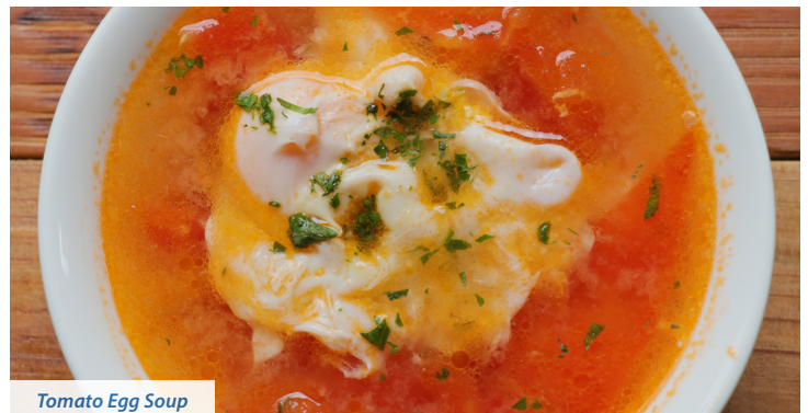
Tomato Egg Soup

Boil chicken broth, add tomatoes and cooked until softened. To make egg drop, simply crack eggs into the pot and stir quickly to avoid it stick together. Cook for 2 minutes and add cilantro in. Sprinkle with black pepper just prior to serving.