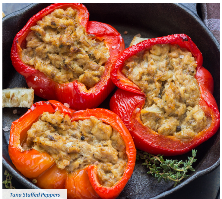
Tuna Stuffed Peppers

Remove the seeds and stems from peppers. Reserve 2 halves and dice the remaining 2. Drain the tuna can, and mix the tuna with the diced bell peppers, onions and celery. Stir in olive oil, black pepper, Italian seasoning and rosemary. Mix well. Stuff all of the ingredients into the bell pepper halves.