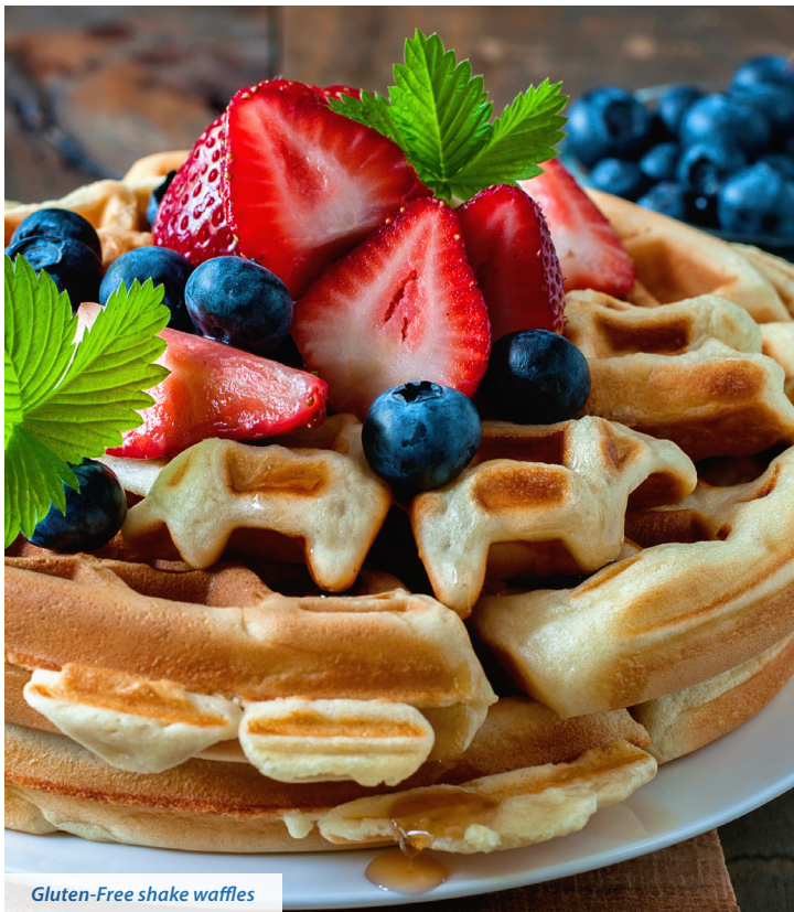
Gluten-Free shake waffles

Add 2 scoops of TLS Nutrition Shake – Creamy Vanilla, 2 scoops of TLS Nutrition Shake – Chocolate Delight and 2 egg yolks to a bowl. Add 120 ml of sugar-free almond milk or soy milk and mix it together with an electric egg beater until a batter forms. Brush a waffle maker with coconut oil or unsalted butter to prevent sticking. Set a 6-minute timer. Pour batter evenly into waffle maker. Serve after the 6 minutes is up.