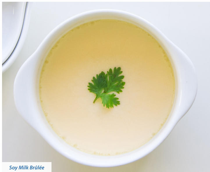
Soy Milk Brûlée

Beat the eggs thoroughly and add 300 ml of sugar-free soy milk and a pinch of salt. Mix well and steam it in a rice cooker with 1 cup of water. Use a chop stick to create a gap between the rice cooker and the lid. After the soy milk brûlée is cooked, take it out of the rice cooker to cool down. Place it in the fridge to chill.