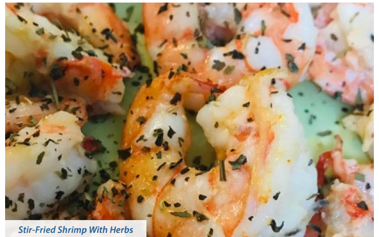
Stir-Fried Shrimp With Herbs

Remove the shrimp shell and the intestines. Sit the shrimp in iced water for one minute, and strain them for later use. Add olive oil in a hot pan. Add shrimp to the pan and pan fry 30–45 seconds each side. Season with sea salt and rosemary.