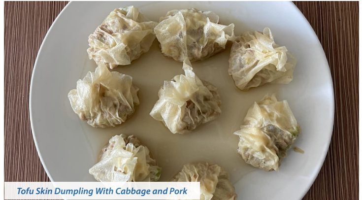
Tofu Skin Dumpling With Cabbage and Pork