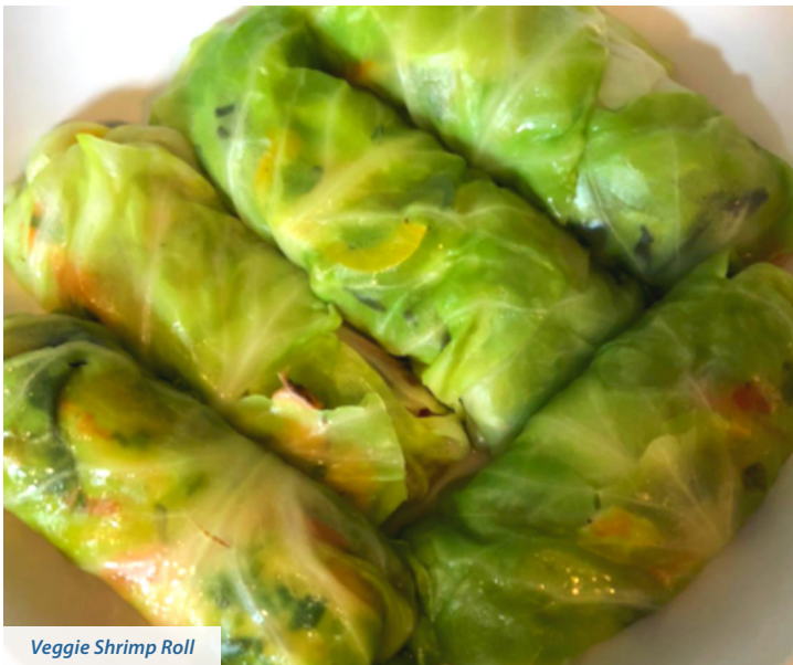
Veggie Shrimp Roll