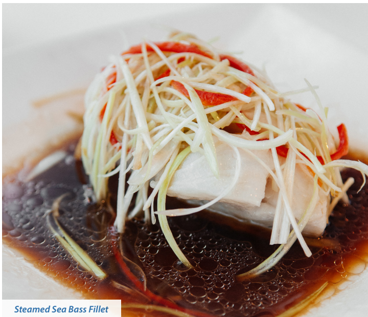
Steamed Sea Bass Fillet

Add 1 cup of water to the rice cooker (about 150 ml). Steam fish for about 12 minutes. When the rice cooker turns off, take out the fish. Don't leave fish stay in the rice cooker for too long, as it will overcook.