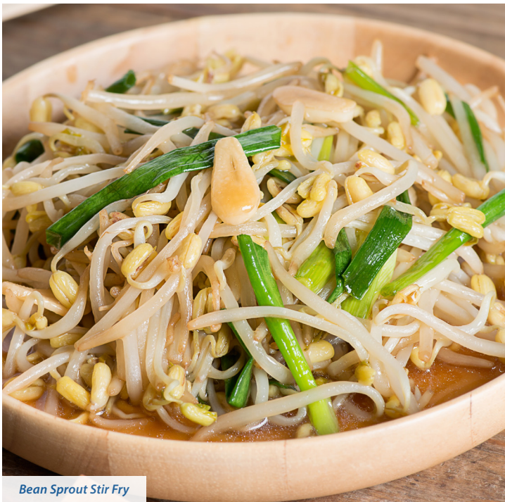
Bean Sprout Stir Fry