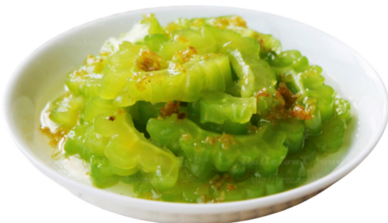
Bitter Melon Salad

Wash the bitter melon and cut into half; use a spoon to clean the seeds. Remove the white part as much as possible to remove the bitter taste. Cut each half into slices. Put slices in a food plastic bag with a teaspoon of salt; rub them well, and let them sit for 10 minutes. Strain the bitter melon and put in a food container. Add sliced lemon. Refrigerate it for 6 hours or overnight.