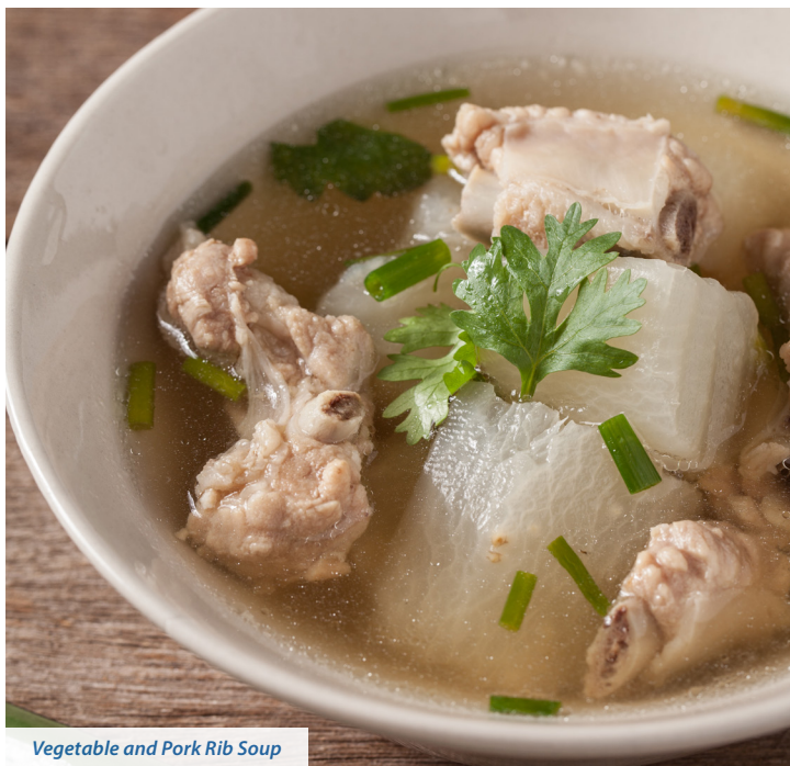
Vegetable and Pork Rib Soup