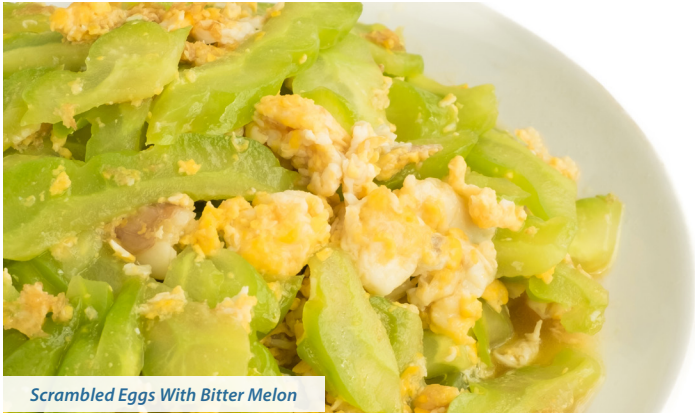
Scrambled Eggs With Bitter Melon

Beat the eggs for later use. Add olive oil in the pot, sauté the onion. Add in bitter melon slices, slightly sauté them. Add in the eggs to the pot and pan fry it. Sprinkle sesame.