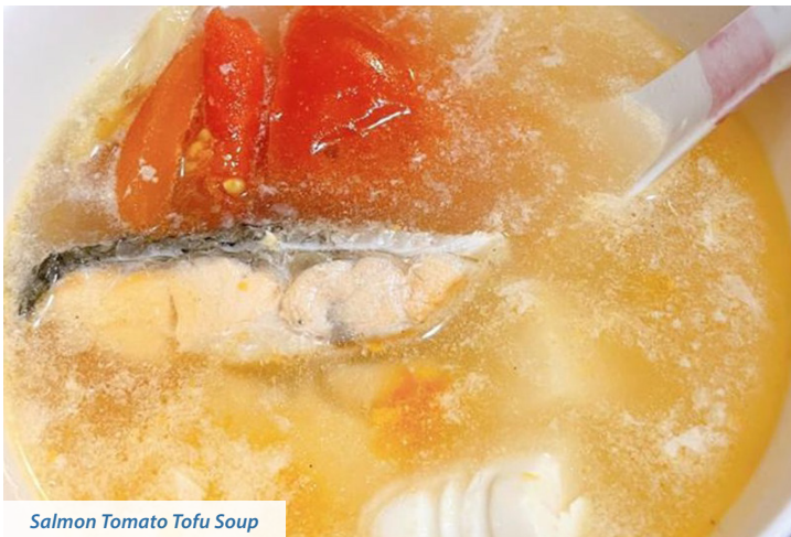
Salmon Tomato Tofu Soup

Add olive oil and ginger in a hot pan; add salmon fillets and pan fry until golden on both sides. Boil a pot of water; add in the pan-fried salmon. Add tomatoes and tofu to the pot, and boil with high heat for 20 minutes. Then change to medium heat for 10 minutes and add a pinch of salt.