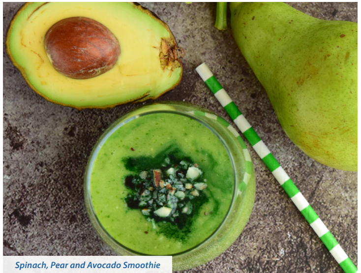
Spinach, Pear and Avocado Smoothie

Combine all ingredients in a blender. Blend well.