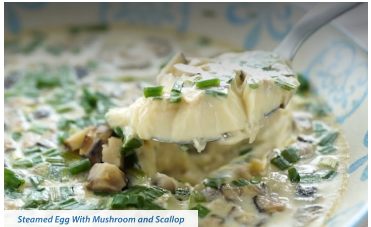
Steamed Egg With Mushroom and Scallop

Cut each slice of tofu skin into 4 pieces. Mix minced pork with monk fruit sugar, low-sodium soy sauce and sesame oil. Cut cabbage into strips and mix with minced pork. Wrap the minced pork with tofu skin. Steam it for 15 minutes. (Recommend adding a sliced carrot under each dumpling.)