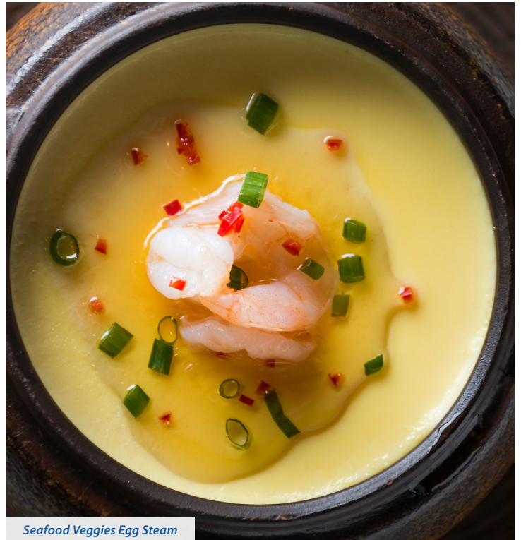
Seafood Veggies Egg Steam

Beat egg in a bowl. In the same bowl, add coconut amino or low-sodium soy sauce and water. Make sure it is fully mixed before adding the rest of the ingredients. Chop shrimps, tomato, spinach and cilantro and add into the egg bowl. Stir well. Steam your egg bowl for about 10–15 minutes over medium-high heat.