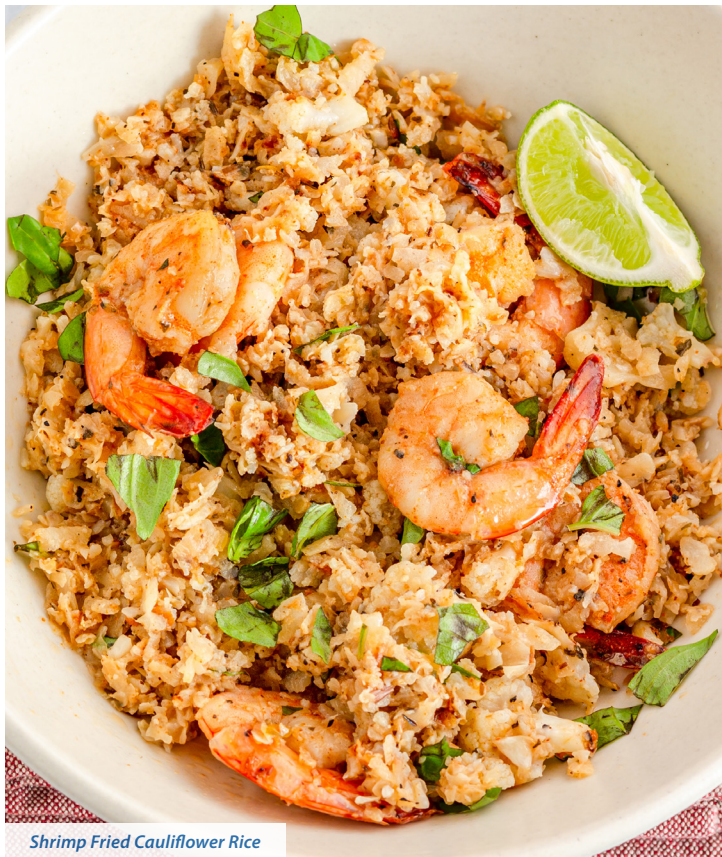
Shrimp Fried Cauliflower Rice

Add pork or chicken stock to a pot, turn on high heat and season it with a pinch of salt. After the soup has reached a boil, add cucumbers, pork strips, enoki mushrooms and wood ear. Cook on low heat for 1–2 minutes.