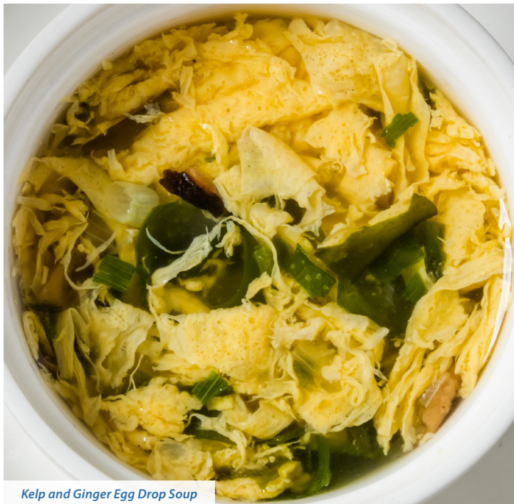
Kelp and Ginger Egg Drop Soup

Submerge the kelp in water for 4 hours (until soft). Cut the kelp and add it to a pot of cold water, then bring it to a boil. The ginger can be added before or after the soup has been brought to a boil. Beat the eggs and add it to the boiling soup. Season with salt. You can also add other ingredients like chicken breast, tofu, and mushrooms when adding the beaten egg.