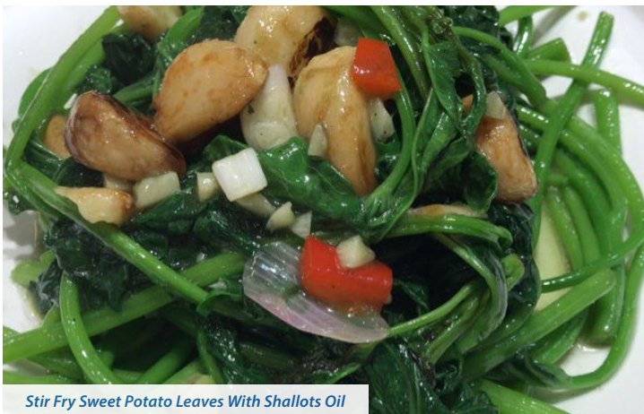
Stir Fry Sweet Potato Leaves With Shallots Oil

Add camellia oil in hot pan. Sauté garlic, shallots and chili pepper for later use. Use the oil to sauté sweet potato leaves with a small amount of water. Add in 1 Tbsp of oil and a pinch of salt. Add in sautéed garlic, shallots and chili pepper. Ready to serve.