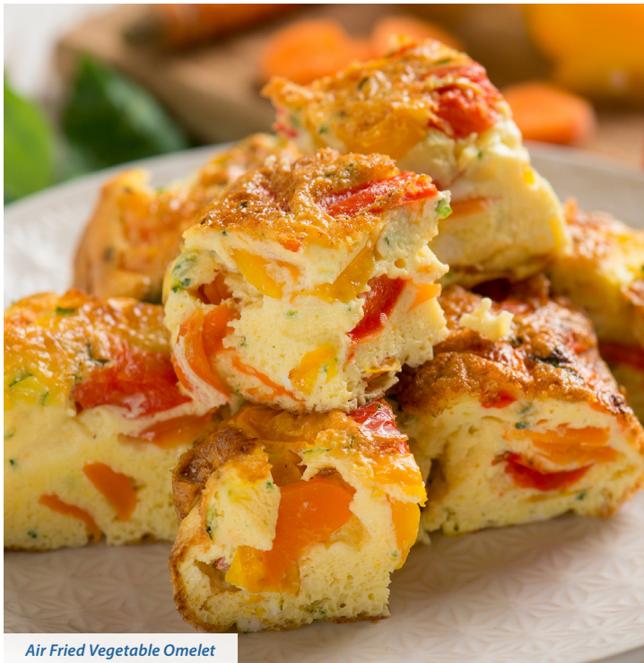
Air Fried Vegetable Omelet

Add a teaspoon of oil to the cake mold; apply well to ensure that the end result releases easily. Preheat the air fryer at 180 C for 5 minutes. In a big bowl, combine eggs, salt and your favorite natural seasonings. Mix well and add cabbage, carrot, bell pepper and scallions. Add the ingredients to the cake mold and tap it a few times on the counter lightly to smooth out the surface. Air fry at 180 C for 15 minutes. After 15 minutes, check to see if the eggs are still runny. If they are, air fry for another 5–10 minutes. Take it out of the air fryer and cool it down for a few minutes. Remove it from the cake mold and let it cool.