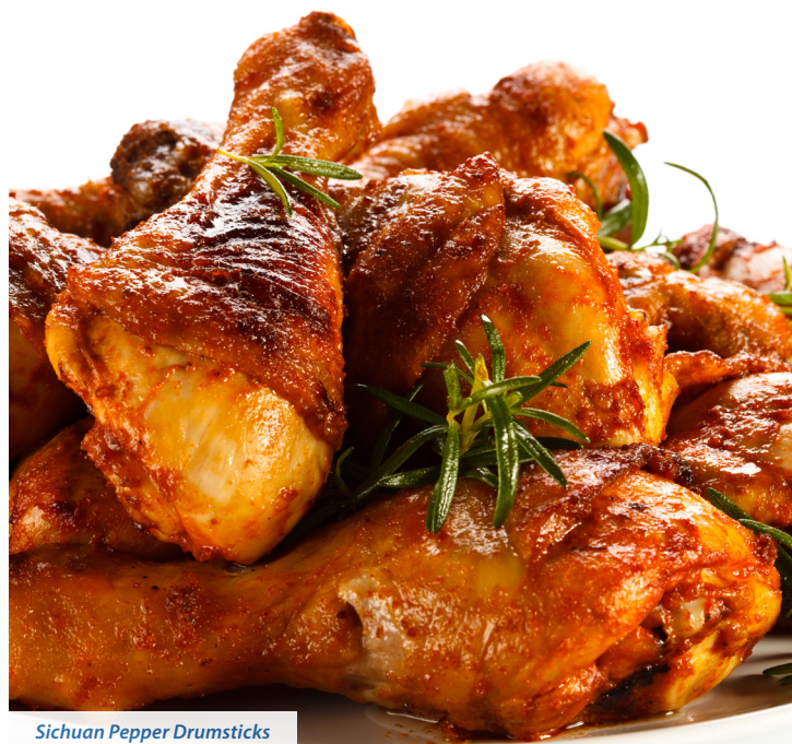
Sichuan Pepper Drumsticks

Defrost drumsticks to room temperature, pat dry and sprinkle on sea salt, white pepper and Sichuan peppercorn powder. Marinate for an hour. Add a Tbsp of oil to a skillet and heat on medium. Sear the drumsticks until brown. Add a cup of water to the skillet and steam it with the lid covered on medium-low heat for 10 minutes. Reduce the sauce and sprinkle on dry thyme seasoning before plating.