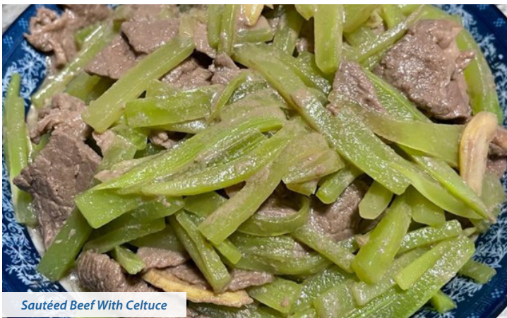
Sautéed Beef With Celtuce