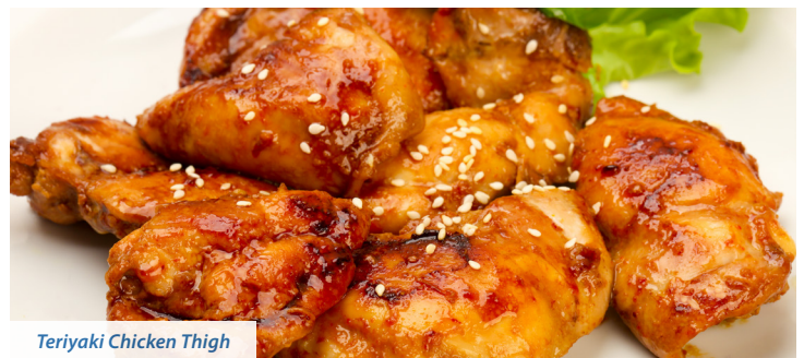
Teriyaki Chicken Thigh

Add the ingredients to the jar following the order as listed. Make sure that the lettuce fills the jar before you close the lid. Store in the fridge. Before eating, turn the jar (unopened) upside down and let the sauce cover the ingredients. Turn the jar upright and open it. Pour the salad on a plate.