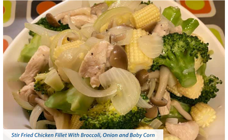
Stir Fried Chicken Fillet With Broccoli, Onion and Baby Corn

Blanch broccoli and baby corn, set aside. Add olive oil in a pan, sauté onion, and then add in chicken and sauté until fully cooked. Add in broccoli, baby corn, pinch of pink salt and sauté together.