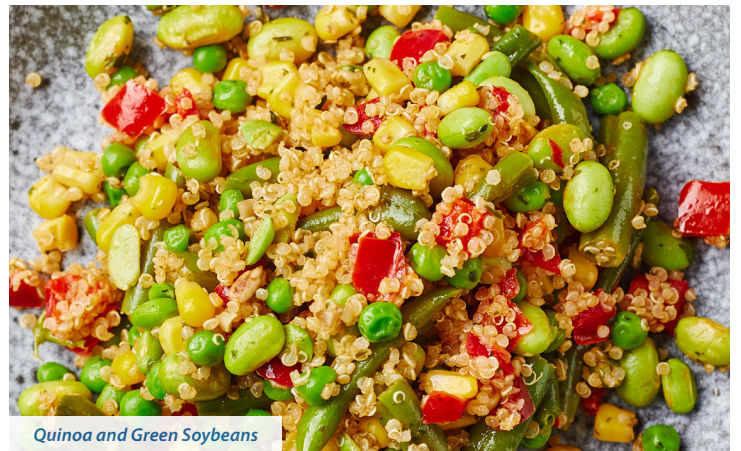
Quinoa and Green Soybeans

Remove the skin and fat from the chicken. Add all ingredients to boiling water; after it reaches a boil, turn the heat to low and simmer for 30 minutes. Season with salt.